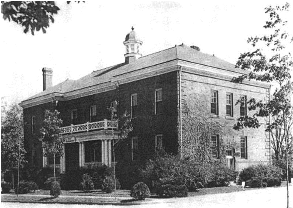
Ft Ben Harrison POST HEADQUARTERS

THE FINANCE CORPS RETURNS TO FORT BENJAMIN HARRISON, IN.