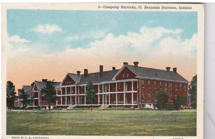
4—Company Barracks, Ft. Benjamin Harrison, Indiana

COSTS: Bus transportation. BOX LUNCH will be purchased at the Park, estimated cost is $25. There will also be hotdogs and drinks free for everyone.